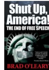
Shut Up, America! The End of Free Speech